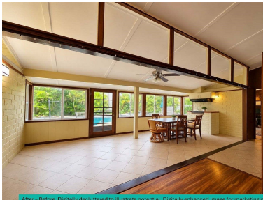
Before. Digitally decluttered to illustrate potential. Digitally enhanced image for marketing purposes. Actual property condition may vary.

Living room as you enter the home Flex/dining area is off to the left. Kitchen is beyond the wall.