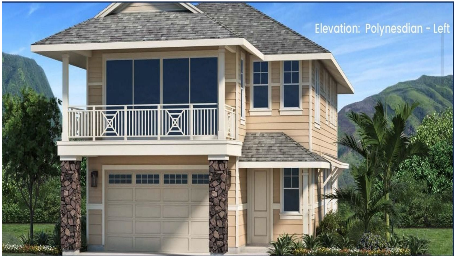
Elevation: Polynesian - Left